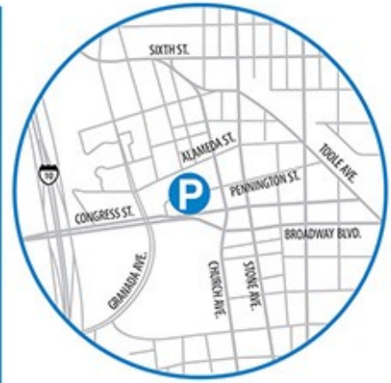
Presidio Parking Garage 165 W. Alameda St.