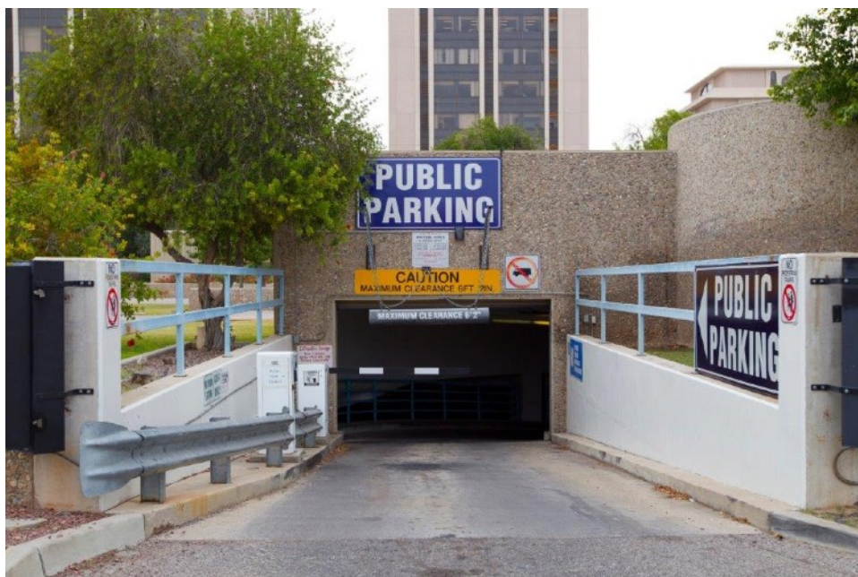
El Presidio Parking Entrance

165 West Alameda (underneath the Pima County Courthouse)